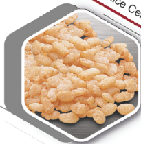
Coated Rice Cereals