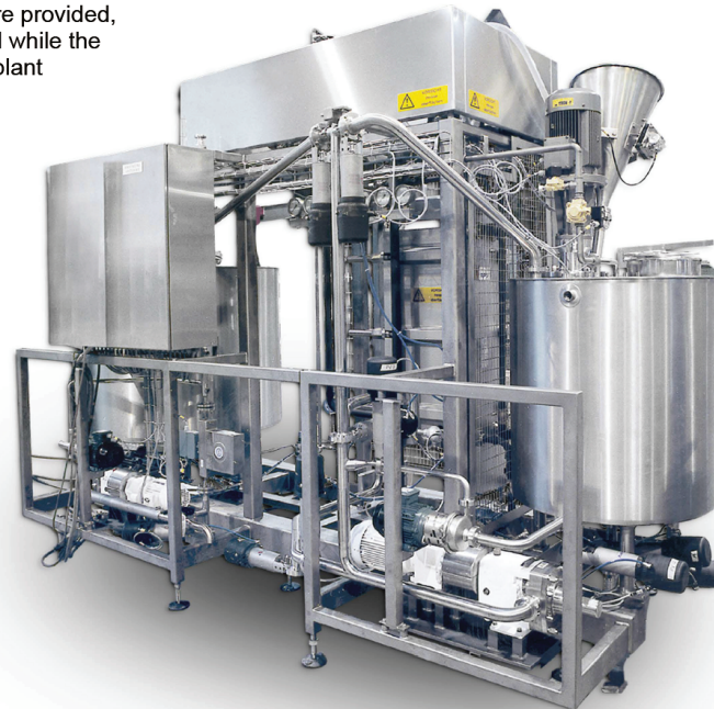
Syrup Coating Skid

The process starts with the accurate weighing and mixing of ingredients using Baker Perkins' Autofeed system. The resulting slurry is then applied to the product via pressurised spraying systems and coating drums.