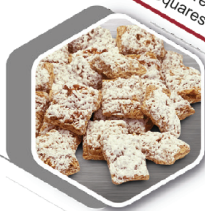
Frosted Shredded Squares