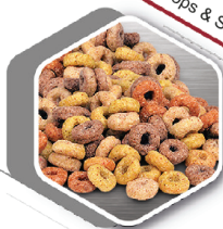
Glazed Loops &amp; Shapes