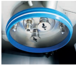
Flat and sealed satellite