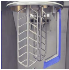
Delivered with 2 tools of your choice and a scraper