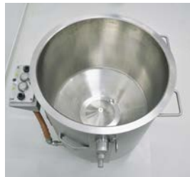
Stainless steel tank with drain plug (temperature probe optional)