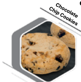
Chocolate Chip Cookies

Baker Perkins supports every piece of equipment throughout its life, with a comprehensive program of parts, service, upgrades and rebuilds. Parts are available around the clock, while our team of service engineers can assist with both repairs and routine maintenance. Existing equipment may be rebuilt to extend service life and/or upgraded to improve performance.